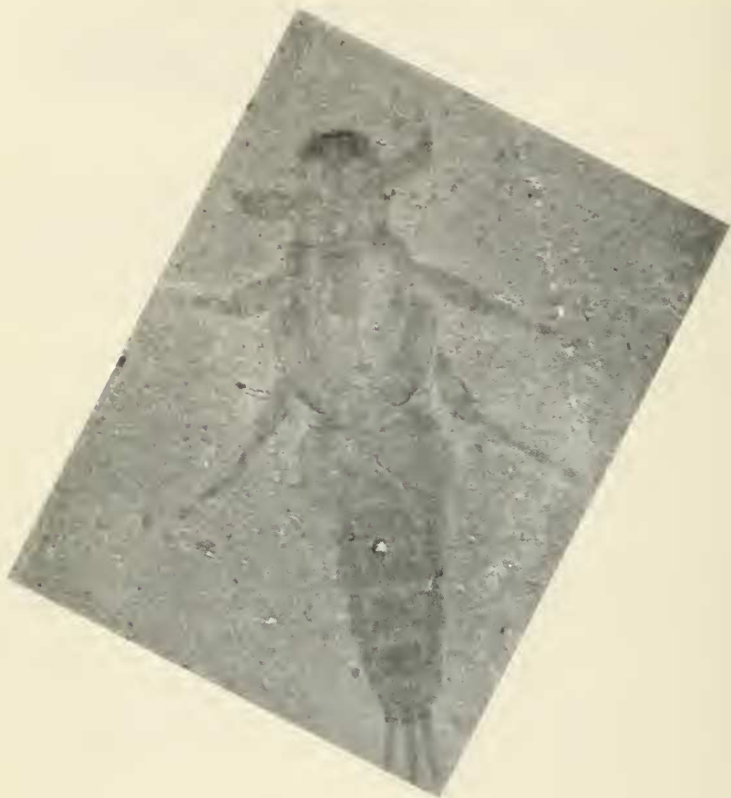
Fig. 1. Potamanthellus rubiensis , dorsal view of complete nymph (7.0 \times ).

Thorax .—Prothorax 1.2 mm in length and 2.0 mm in width at widest point. Pronotum somewhat rectangular in shape with anterior margin slightly concave; anterolateral covers of pronotum slightly pointed. Prothoracic femur complete and stout. Proximal \frac{1}{2} of prothoracic tibia present. All thoracic legs showing a mottled color pattern. Each tarsal claw long, slender and edentate. Metathoracic wing pads large measuring 3.4 mm in length. Posterior margin of the dorsal portion of the metathorax with no minute, median, backward projecting spine visible.